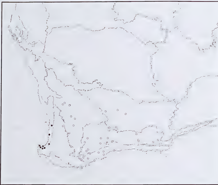
Figure 3. Distribution of Olearia strigosa (●) and O. muricata (○).

Typification. The specimen taken to be the holotype of Eurybia aspera is from the personal herbarium of Steetz (now at MEL) and is the only one encountered labelled with this name by Steetz himself. On the sheet Steetz notes that this specimen was segregated from Preiss' collection of Eurybia paucidentata var. hispida , namely Preiss 84 from Greenmount.